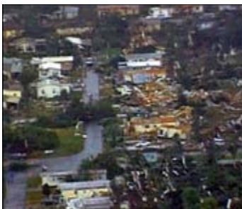
View of Lake Mary, Florida after a tornado swept through in February 2007.

During the Fall of 2007, the Florida Kidney Disaster Coalition was pleased to announce a unique and exciting opportunity for disaster education: The All Hazards Educational Series .