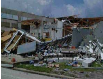
A building destroyed by Hurricane Charley.

Since 2005, the Coalition has worked diligently to provide education and outreach to all Florida dialysis patients, providers, and community stakeholders, both renal and non-renal. Coalition members regularly travel to professional meetings in order to exhibit, provide resources, and recruit new members.