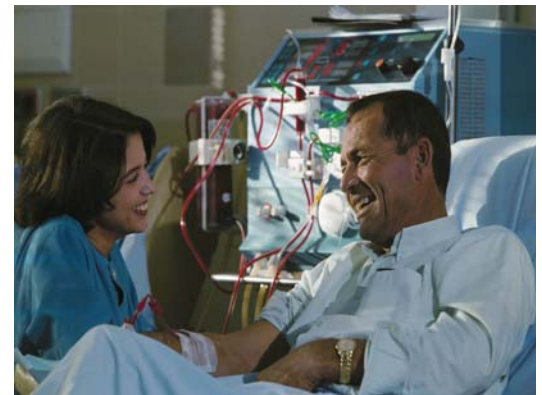
Patient receiving dialysis treatment while speaking with his Patient Care Technician, an integral part of the dialysis team.

Florida represents a unique opportunity for the ESRD community and emergency management